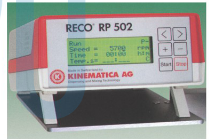
Control for speed, working time and max. temperature