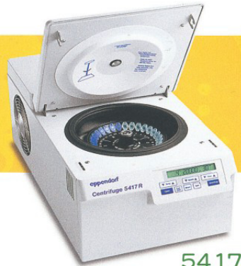
5417C / R